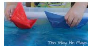
The Way He Plays