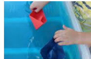
PAPER BOATS - outside water play idea -